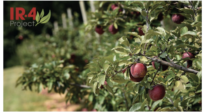
> IR-4 Background 4 (Arboretum)

What else would you like to see on this page? Let me know.