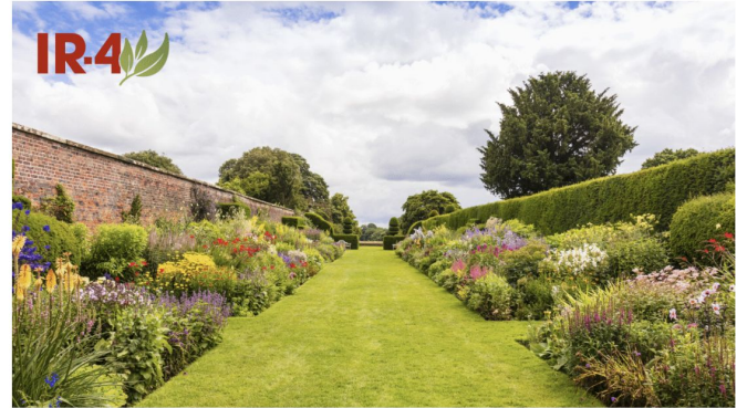
> IR-4 Background 5 (Lavender)